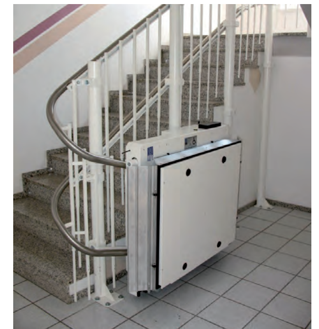
HIRO 320 in the parked position

An intercom system can be installed on the system. If you need assistance while using the lift, you can call any internal or external emergency number.