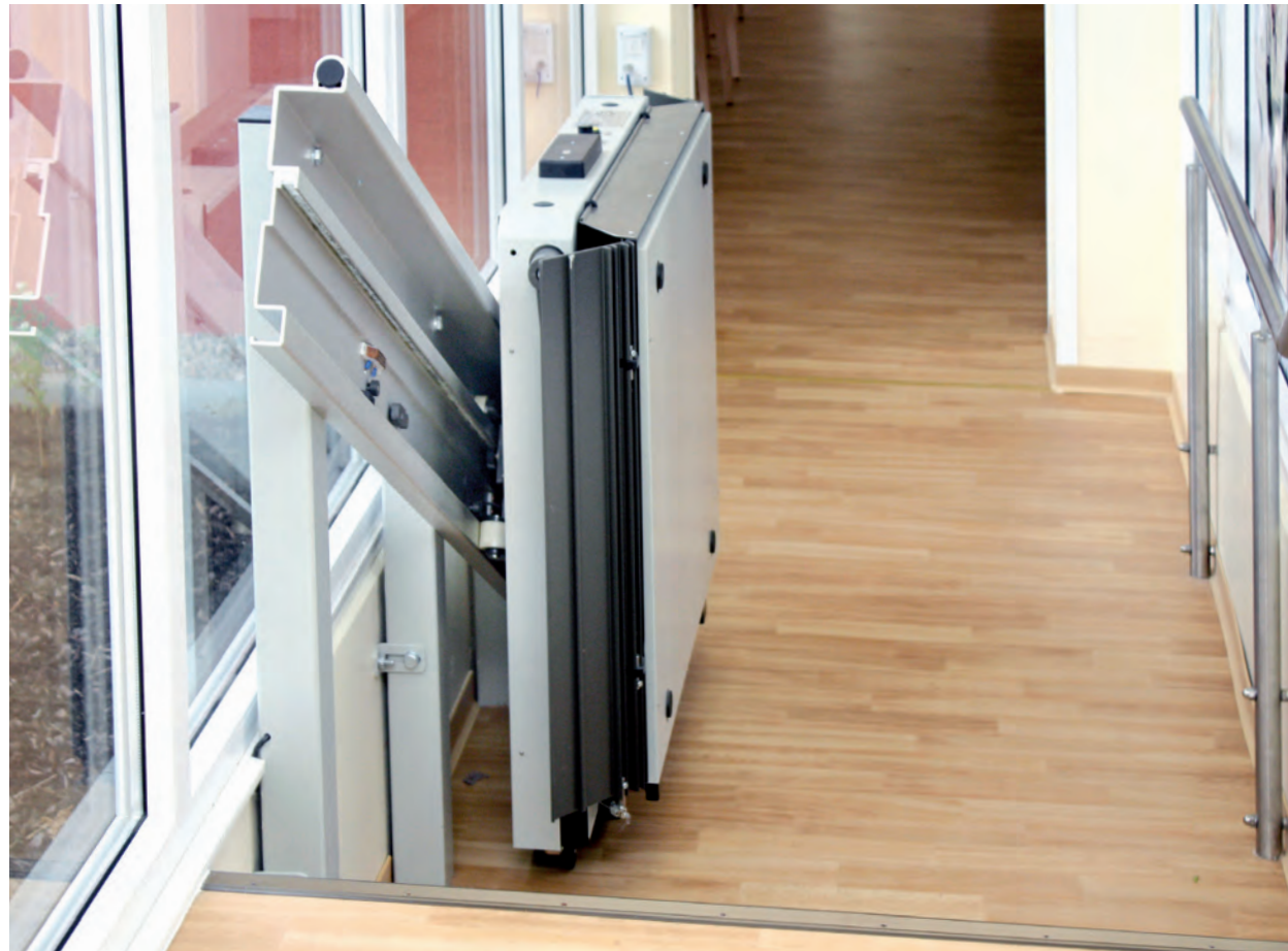
HIRO 350 in space-saving parked position

The HIRO 350 can be installed on all straight stairways, both indoors and outdoors. It is frequently used, for instance, for stairs in entryway areas.