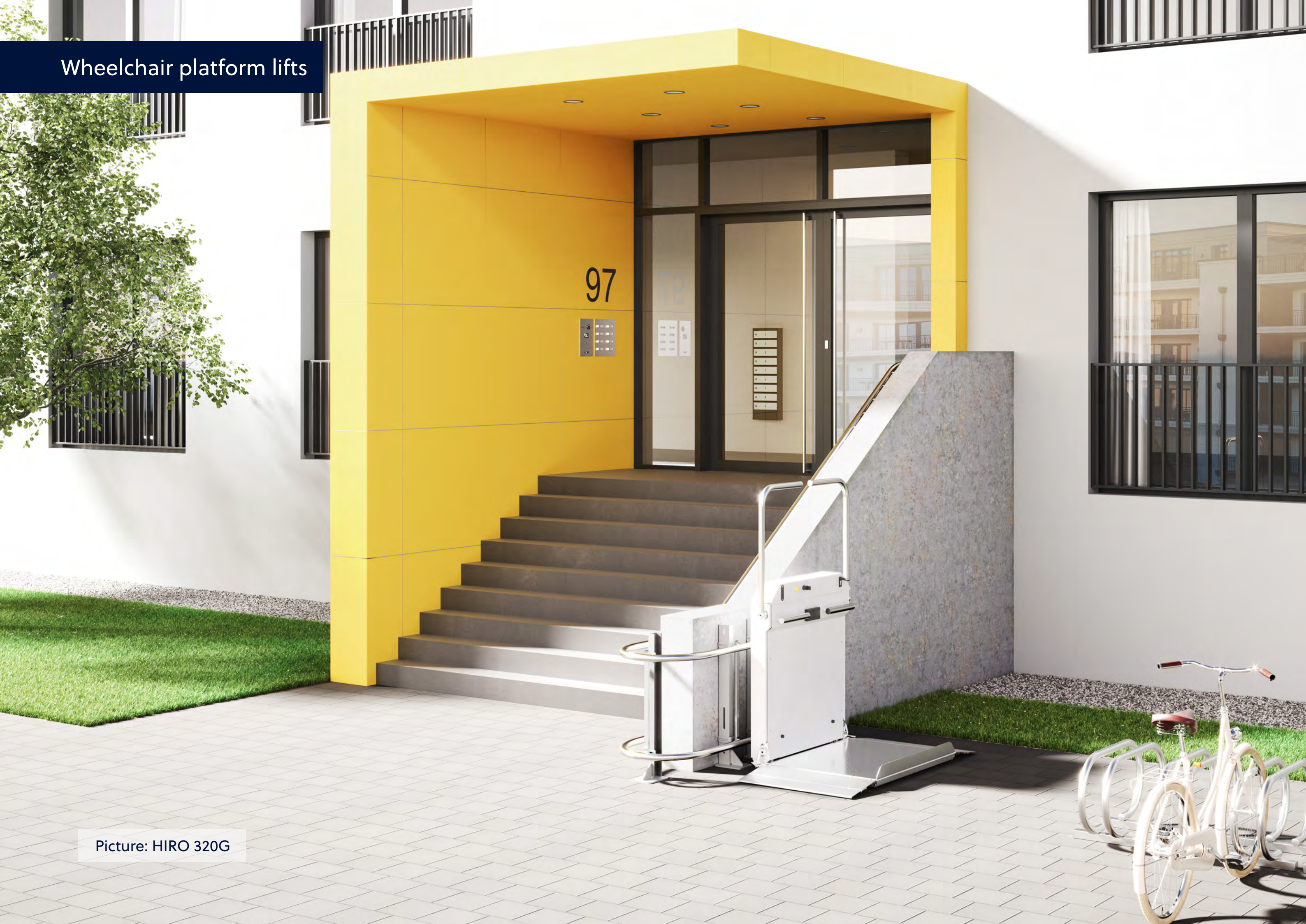
Picture: HIRO 320G