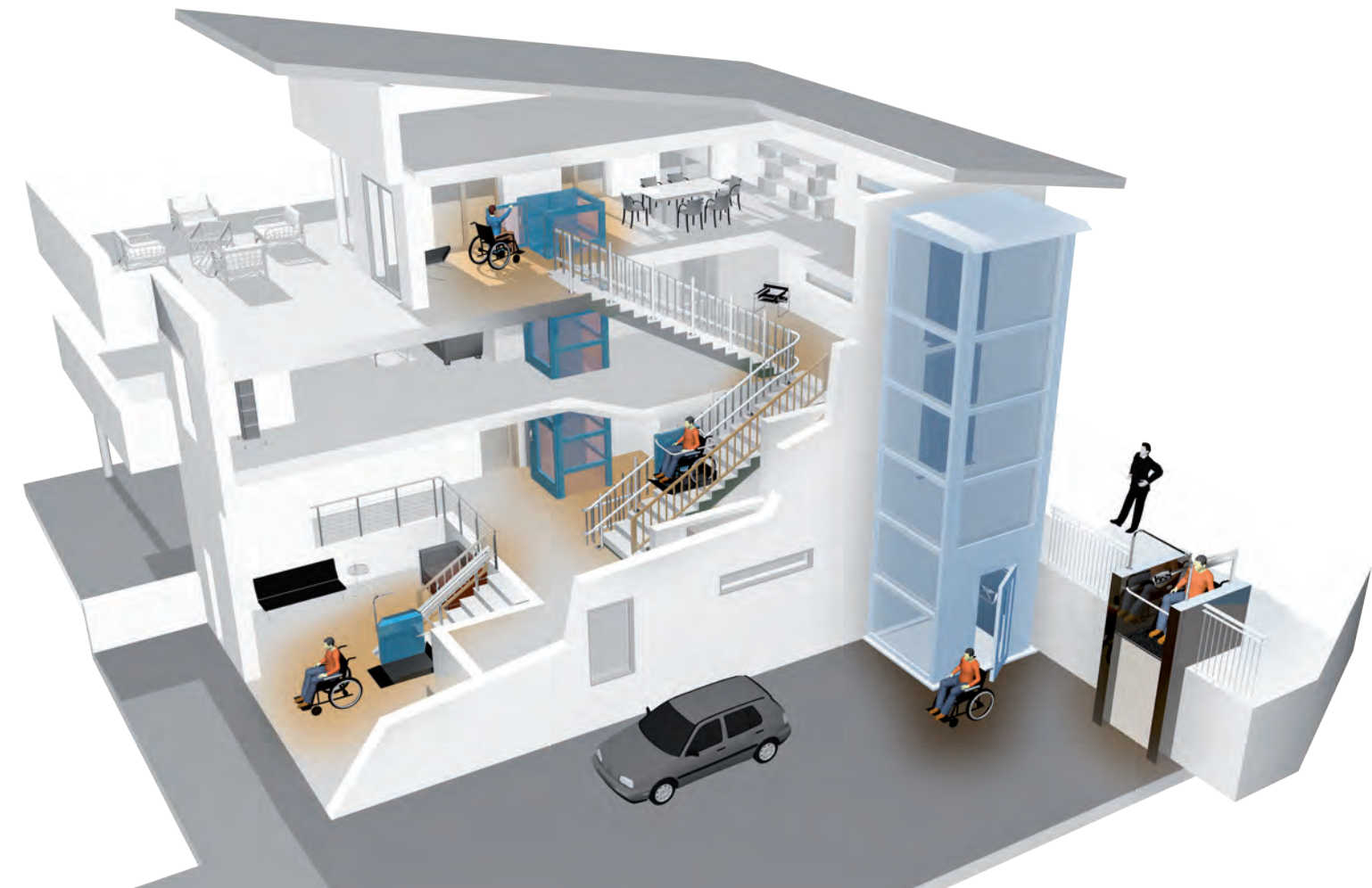
Wherever you want to ensure barrier-free accessibility – HIRO LIFT has the right lift for your structural situation.

Our customers have a diverse range of expectations for their platform lifts. No two living situations are exactly alike. Thanks to our extensive product portfolio, we can react optimally to any requirement. Our experienced technicians can almost always find a quick, affordable solution in even the most difficult cases.