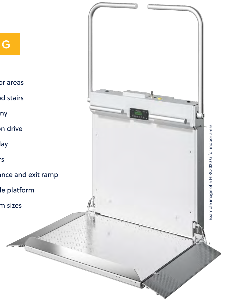
Example image of a HIRO 320 G for indoor areas

i The HIRO 320 K is also available as a space-saving variant for indoor areas.